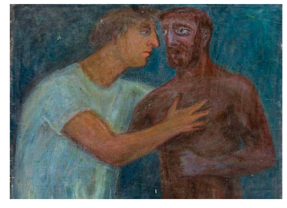
Judit Reigl Jacob Wrestling with the Angel (Friends), 1947 Hungarian National Gallery - Museum of Fine Arts, Budapest