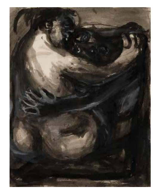
Judit Reigl Jacob Wrestling with the Angel (Embrace), 1947 Hungarian National Gallery - Museum of Fine Arts, Budapest