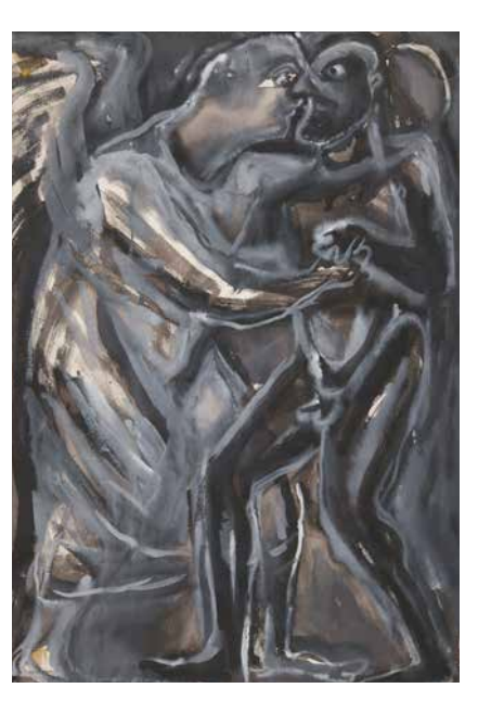
Judit Reigl Jacob Wrestling with the Angel (Two Men), 1947 Hungarian National Gallery - Museum of Fine Arts, Budapest